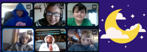
6th Grade Sleepy Heads